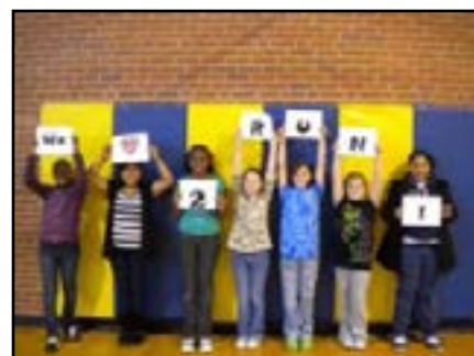
Showing running spirit for a Donor's Choose proposal